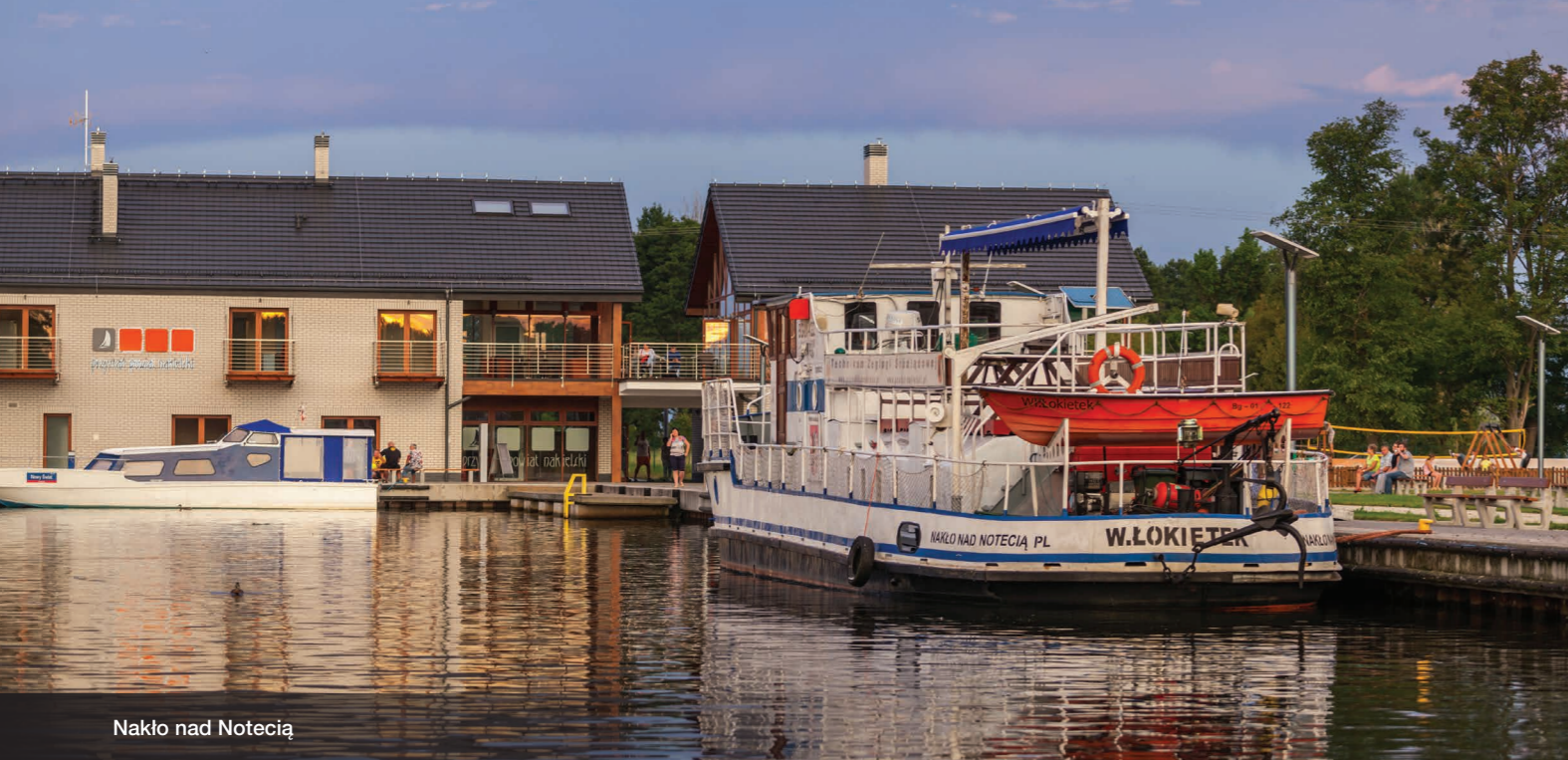
Nakło nad Notecią