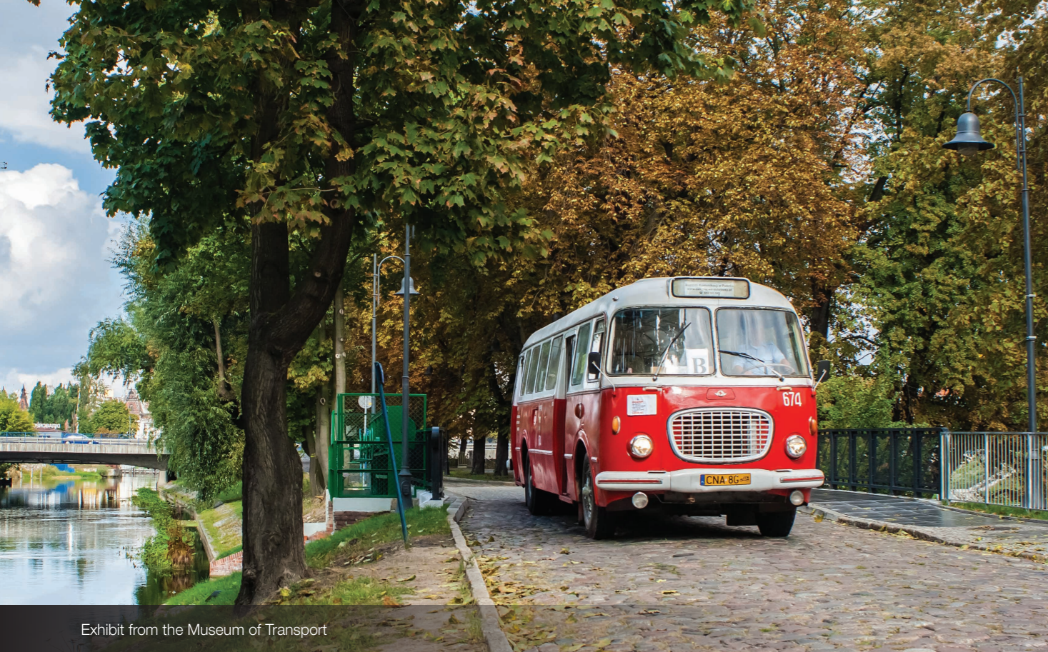
Exhibit from the Museum of Transport

Olszewka is known thanks to its golf course, which was established fifteen years ago as one of the sites of the “Ecomuseum”. It is a great place to start your adventure with golf. This place is friendly both to professionals and to beginners who want to learn to play golf.