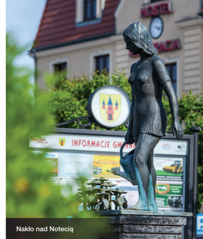
Nakło nad Notecią