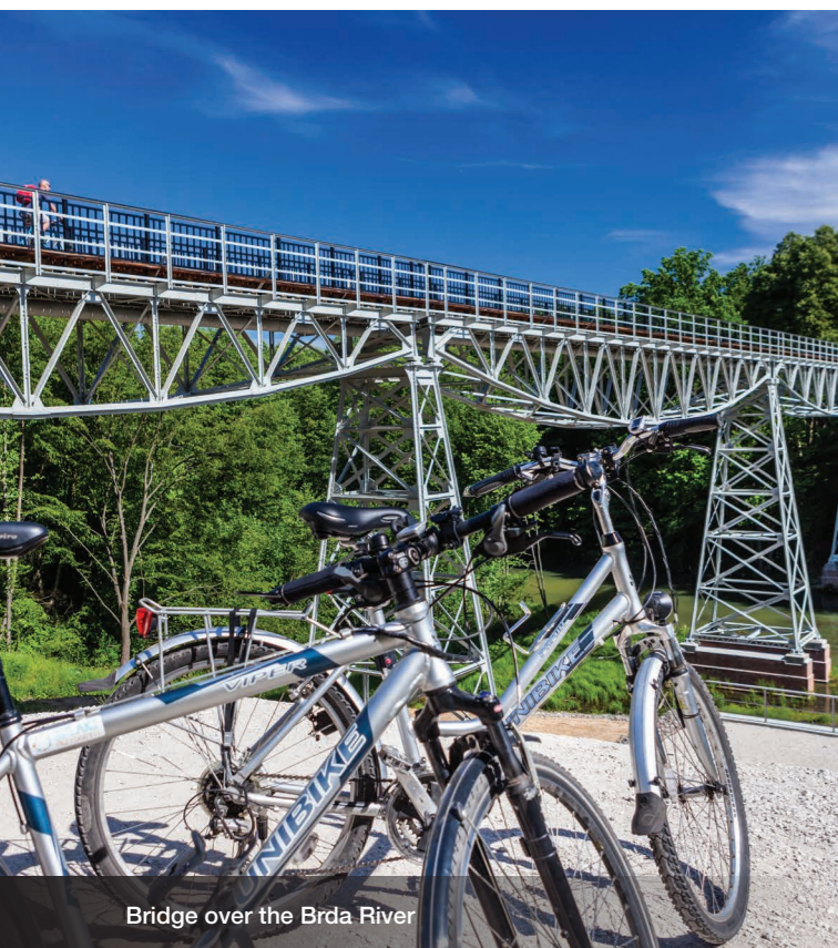
Bridge over the Brda River

We start our trip in the park on the Old Bydgoszcz Canal in the area of the Grunwaldzkie roundabout. We continue alongside the bank and turn right into Bronikowskiego Street. After reaching Grunwaldzka Street, we turn to the left. We pass the junction and arrive to the biking trail on the right side of Koronowska Street. We take the path straight to the north. The trail, which is initially an asphalt lane, becomes a gravel path after crossing Oplawiec Street. It marks the beginning of the most challenging section of the trail. After a short while it becomes an undulating path as it winds its way through trees. Tryszczyn can be reached by riding in parallel to the busy main road No 25 (DK25).