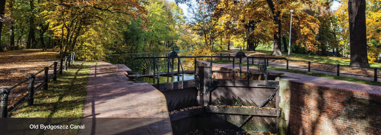
Old Bydgoszcz Canal