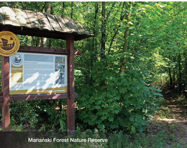
Mariański Forest Nature Reserve